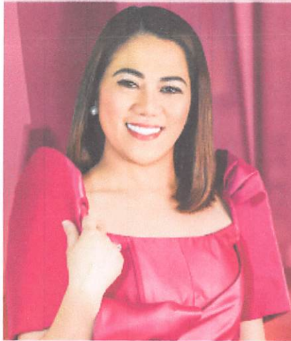
MAYOR LOVELY REYNOSO - PONTIOSO